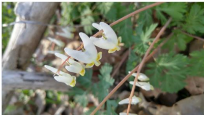
Dutchman's Breeches ( Dicentra cucullaria)

More and more, I'm looking at my own stewardship endeavors as finding ways to connect others with the personal experience of Nature. Getting children, family and friends outdoors to see how they can touch and are in return touched by their surroundings. Drawing parallels between the new and captivating perception with the old, known and familiar; and expressing those perceptions in terms of how they make us feel and memories they evoke. By sharing a personal story; others will listen and be inspired. It wasn't until I realized that the Dutchman's Breeches I was introduced to in Botany class reminded me of Dutch dolls I had as a child and walks in a nearby Nature Preserve with my mother back then, that I understood so clearly why those flowers instantly made me smile and want to plant my own next Spring. Stewardship might work through our words and our hands, but it comes from the heart. This Autumn, think about ways to share those connections, memories and experiences as ways of offering the gift of Stewardship – and the wonders of Nature — to others.