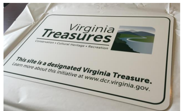
The new Virginia Treasures sign

Banshee Reeks has been designated a Virginia Land Conservation Treasure. The Treasures program's goal is "to preserve, protect and highlight Virginia's most important ecological, cultural, scenic and recreational assets". A new sign will highlight this honor for visitors.