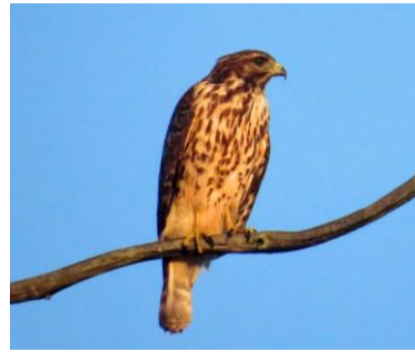
Red-shouldered Hawk perched

Banshee Reeks has been selected as the site of the Virginia Outdoors Festival . The festival, celebrating the 50 th anniversary of the Virginia Outdoors Foundation (VOF), will be held on October 8 th and will feature some great activities including live music, guided tours, a fishing derby ...and food! VOF holds the easement to BRNP and many other fantastic properties. We're honored that Banshee Reeks was chosen as the site of this celebration out of the 750,000 acres of land that VOF holds.